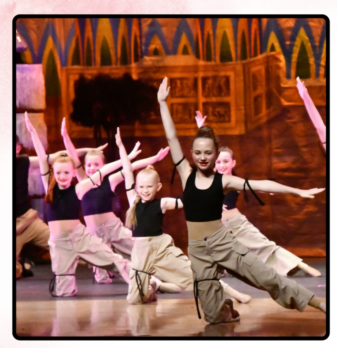
Should you choose to sit the recital out, "not in show" notes are due by November 1st.